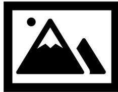
Figure 2: Equipment & Fixtures