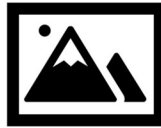
Figure 1: Device Drawing

The purpose of this study is to define the test methods used to demonstrate the [Property] of the finished [Device Name] product when [Specify Conditions]. Describe the objective of the test and the data that will be used, give background information, and describe the device.